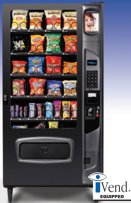
32 Select Black Diamond Series Snack Merchandiser 72" x 35.2"W x 34.75"D Shipping Weight 519 lbs 32 selections, 474 item capacity Card reader available..