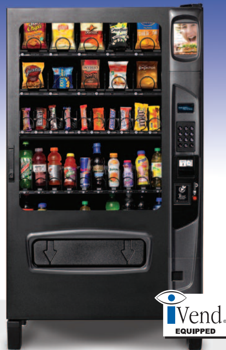
40 Select DZ Chill Center Black Diamond Series Glass Front Snack & Beverage 72" x 41"W x 38"D, Ship Weight 975 lbs 40 Selections Capacity: 825 Snack Items / 120 Beverage Cans: 12 oz; Bottles 16.9 oz, 20 oz or 24 oz