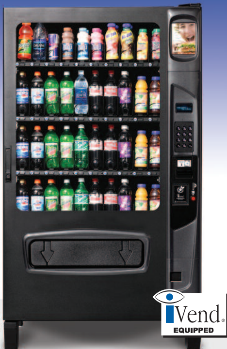
40 Select Beverage Center Black Diamond Series Glass Front Can & Bottle 72" x 41"W x 38"D, Shipping Weight 975 lbs 40 Selections Capacity: 240 Items Cans: 12 oz; Bottles 16.9 oz, 20 oz or 24 oz