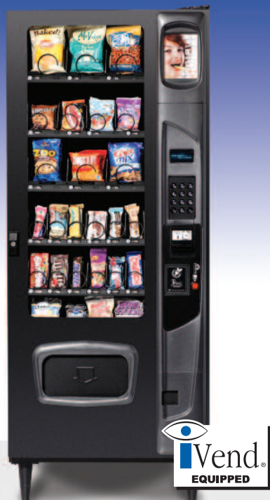
23 Select Black Diamond Series Snack Merchandiser 72" x 29.3"W x 34.75"D, Shipping Weight 445 lbs 23 selections, 384 item capacity Card reader available.