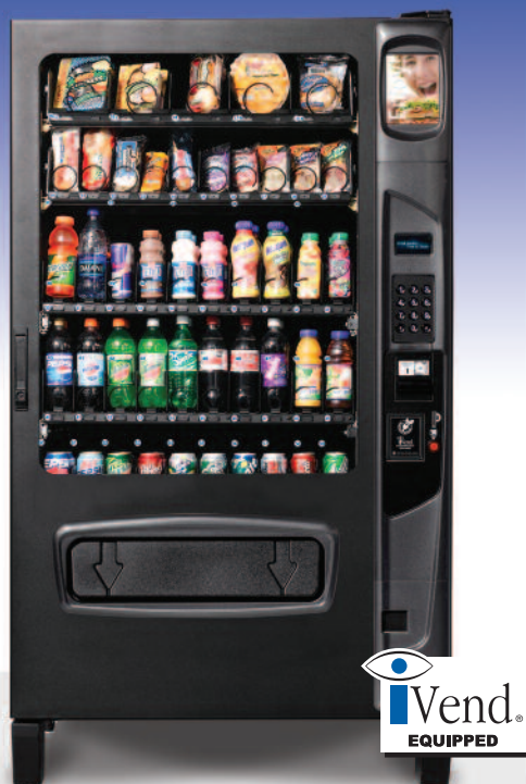
45 Select Chill Center Black Diamond Series Glass Front Can, Bottle and Food 72" x 41"W x 38"D, Shipping Weight 975 lbs 45 Selections Capacity: 124 Food Items/180 Beverages