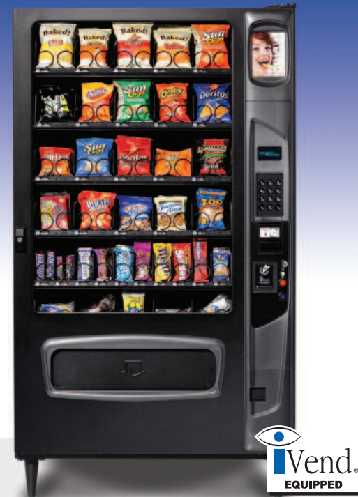
40 Select Black Diamond Series Snack Merchandiser 72" x 41.1"W x 34.75"D Shipping Weight 628 lbs 40 selections, 630 item capacity Card reader available.